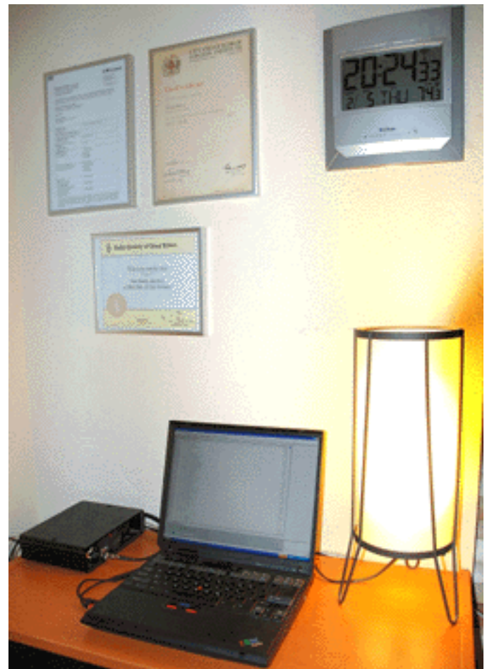
In case you've wondered what the Echolink station looks like, here it is, in position in its new home.