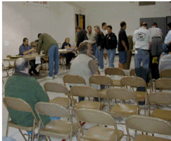
Above: tension builds as auction goes await the start of activities at last month's Annual Auction meeting.

June 11 EARS Monthly Meeting, 7:30 p.m. June 20 Ears Monthly Breakfast, 8:30 a.m. June 16 Field Day Planning Meeting, 7 p.m. June 23 EARS Board Meeting, 7 p.m. June 27 VE Testing, 9 a.m. June 27-28 Field Day!