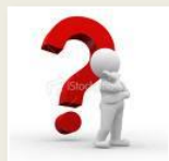
Vice President Currently vacant