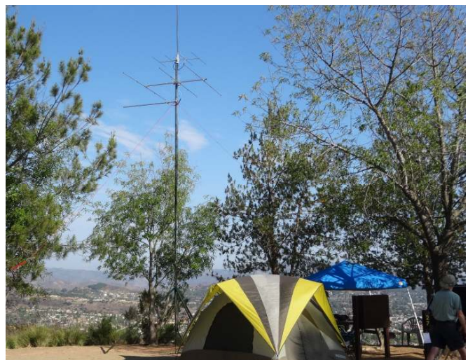
The VHF/UHF Station