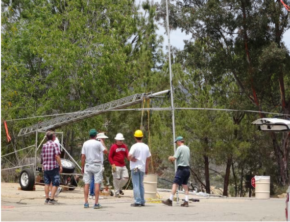
The 20m beam goes up Friday morning.